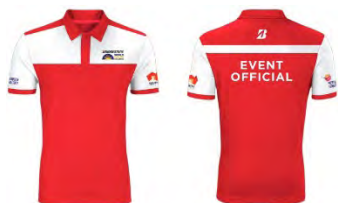
Red Polos – Event Officials