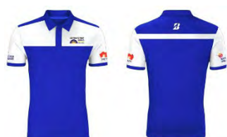
Blue Polos – Event Volunteers