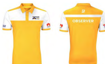
Yellow Polos – Observers